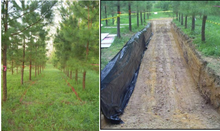
Figure 3. (left) The array of eight loblolly pine in the UT FRREC. (right) A pit was excavated to 1 m deep.