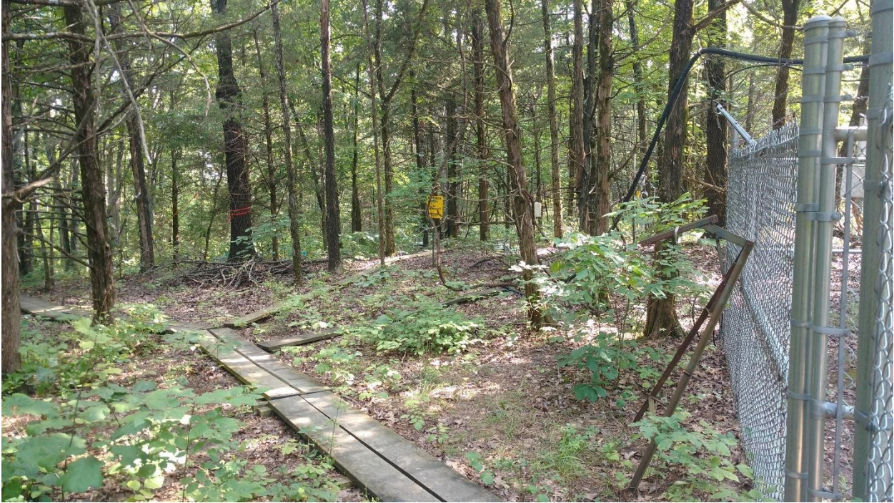
Figure 4. View of the forest near the base of the tower that is located inside the fenced area at right.