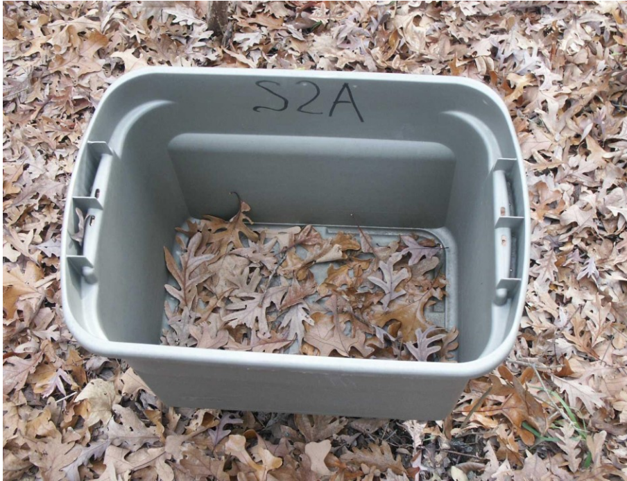
Figure 5. Photograph of one of the litter collectors.

constant mass and then sorted before determining the dry mass ( \pm 0.01 g) of leaf, reproductive and woody litter.