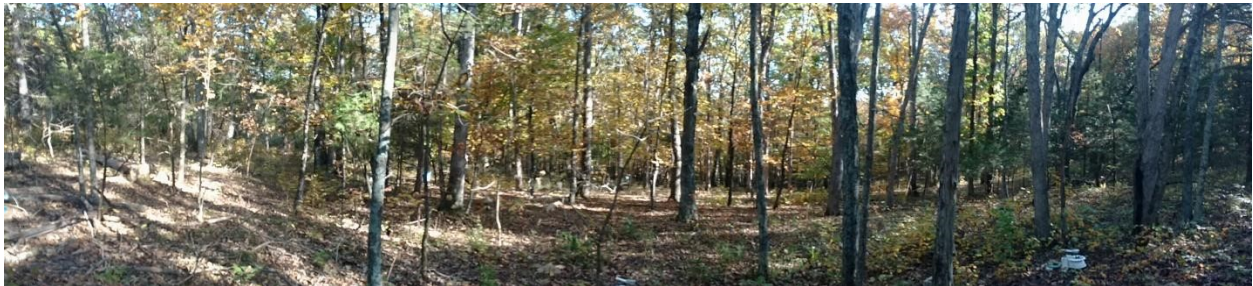
Figure 3. View of the forest from the ground looking to the southeast from near the base of the tower.