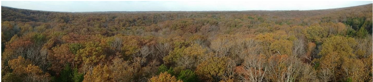
Figure 2. View of the forest from the top of the tower looking west.

Baskett Forrest is within the Ozark border region of central Missouri. Second-growth upland oak-hickory forests constitute the major vegetation type at Baskett Forest (Rochow, 1972; Pallardy et al., 1988). Major tree species include white oak ( Quercus alba L.), black oak ( Q. velutina Lam.), shagbark hickory ( Carya ovata (Mill.) K. Koch), sugar maple ( Acer saccharum Marsh.), and eastern redcedar ( Juniperus virginiana L.). Although these species co-occur in MOFLUX forests, there are differences in which species dominate in particular locations.