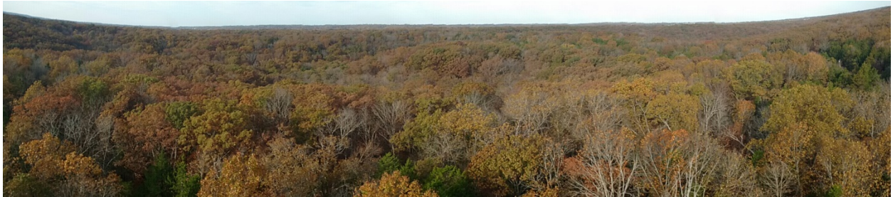
View of the forest from the top of the MOFLUX tower looking west.

Meteorological measurements include precipitation, temperature and relative humidity made at the top of the 30 m flux tower and used to formulate potential meteorologically based predictors for tree mortality. Precipitation was measured with a recording tipping bucket rain gauge. Data were totaled over 30 min periods. Atmospheric vapor pressure deficit (VPD) was computed from temperature and relative humidity. At the MOFLUX site, routine meteorological measurements are made with plenty of redundant sensors to minimize the risk of measurement gaps. The full complement of AmeriFlux core site measurements are available at https://ameriflux.lbl.gov/ .