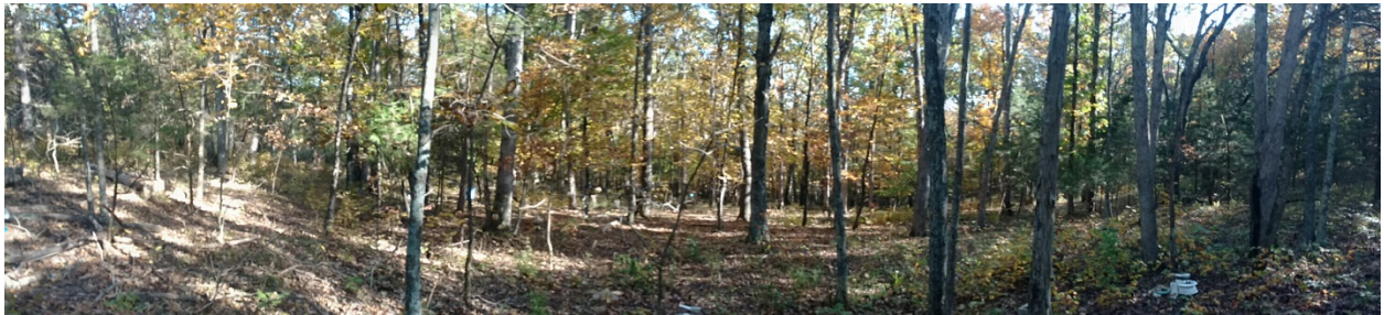
View of the forest from the ground looking to the southeast from near the base of the MOFLUX tower.