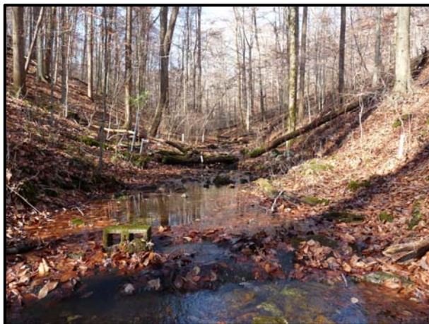
Figure 1 – The West Fork of Walker Branch Watershed in autumn.

- Measurements included tensile loss of cotton strips after approximately 35 day-long incubation periods.