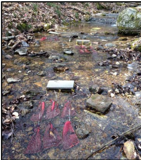
Figure 3 – Litterbags deployed in Walker Branch.

Leaf-litter breakdown rates were calculated for leaves from 3 tree species in 5 locations along the downstream temperature gradient in winter. The leaf-litter decomposition experiment followed a typical litterbag approach (Benfield 2006). Leaves from 3 species were used in the experiment: red maple ( Acer rubrum ), tulip poplar ( Liriodendron tulipifera ), and white oak ( Quercus alba ). In autumn 2011, abscised, senescent leaves of tulip poplar, red maple, and white oak were collected daily from tarps laid on the forest floor in WBW. After collection, the leaves were air dried in the laboratory 2 weeks before constructing the litterbags. A total of 12.0 g ( \pm 0.1 g dry mass) of dried red maple, tulip poplar, or white oak leaves were placed in each litterbag. The nylon litterbags were 37.5 cm long, 20.0 cm wide, and had a mesh size of 3 x 3 mm to allow aquatic invertebrates access to the leaf material contained in each litterbag.